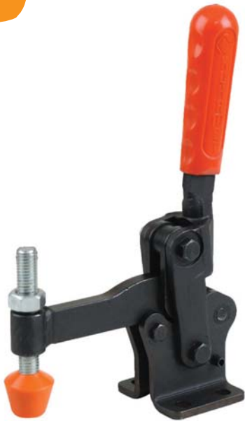
Befestigungsart : mit waagrechtm Fuß Body Mounting Base: Horizontal