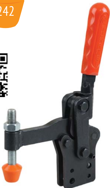
Befestigungsart : mit senkrechtem Fuß Body Mounting Base: Vertical